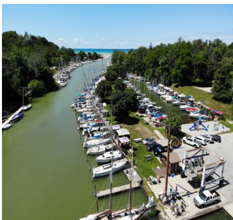
New aerial photos available on the updated website: www.harbourlightsmarina.on.ca